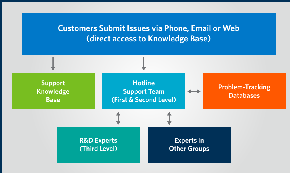
Overview of technical support process